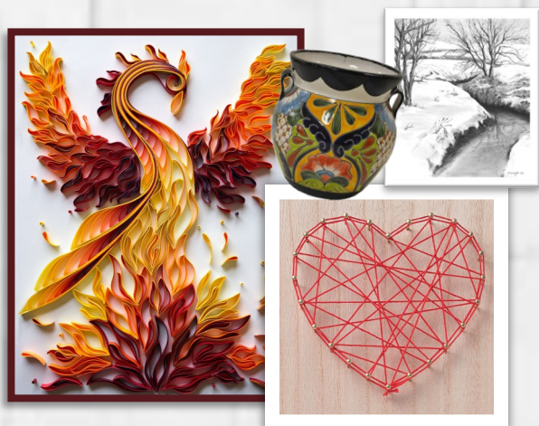
artwork shown for example only